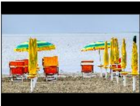
Wet morning at the beach