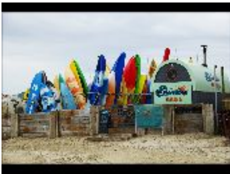
Hot Beach in Dorset