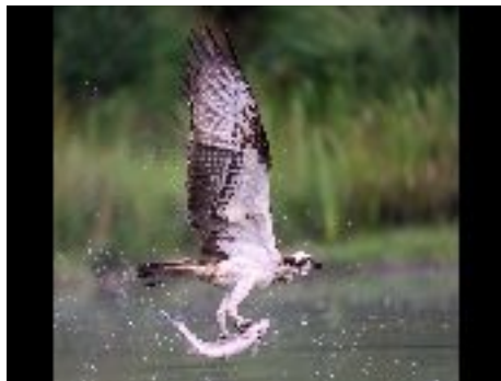
Osprey Bags a Trout