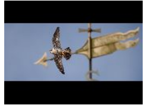
Gone with the wind