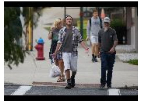
I'm Ready for My Close