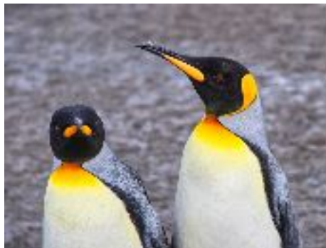
Looking at You