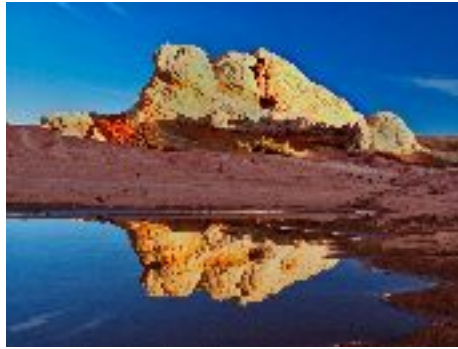
Sunrise at White Pocket