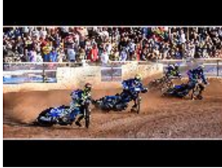
The Final Bend