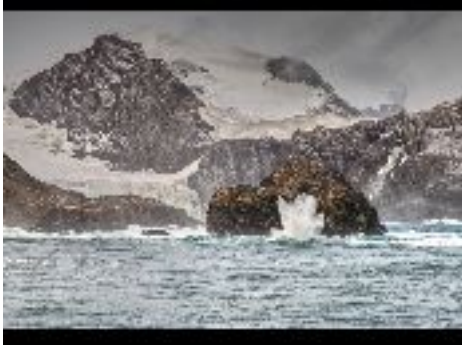
Elephant Island South Atlantic