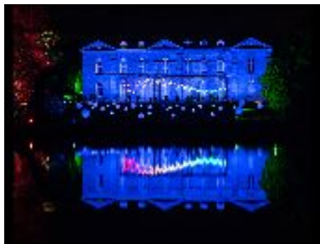
Spectacle of Light, Compton Verney