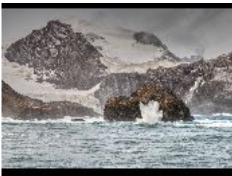
Elephant Island South Atlantic