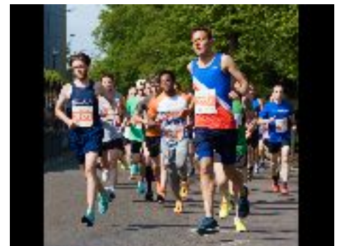
Breaking Away from the Competition