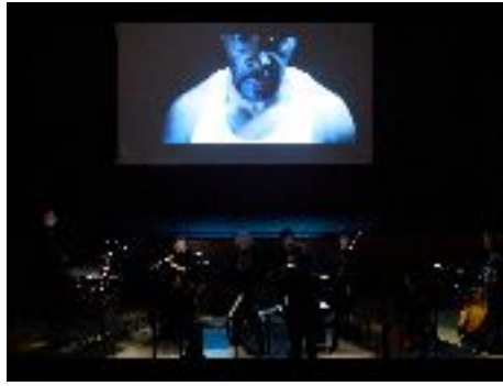
Requiem for a Heavyweight