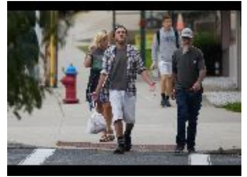
"I'm Ready for My Close-Up, Mr DeMille."