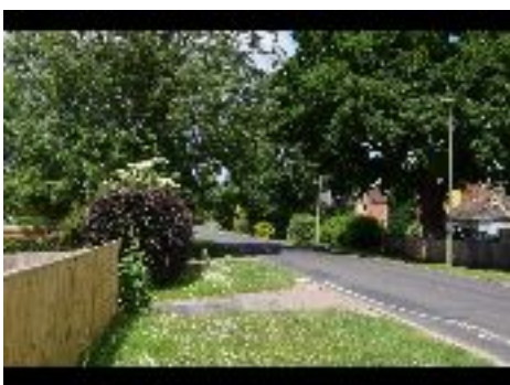
The Moors Kidlington