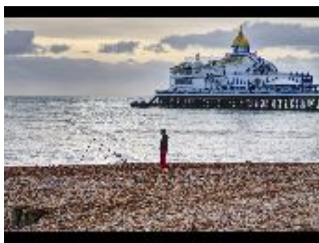
Fishing By The Pier