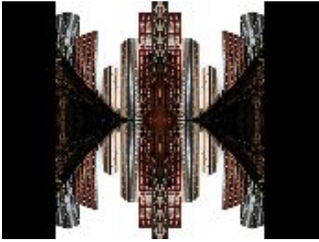
Flipping Over London