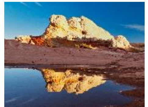
Sunrise at White Pocket