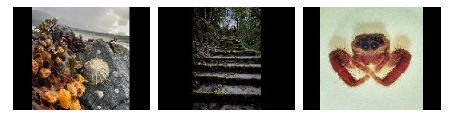
Seashells and Seaweed