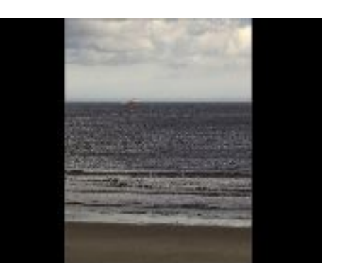
Sea, ship, sand, sky and seagull